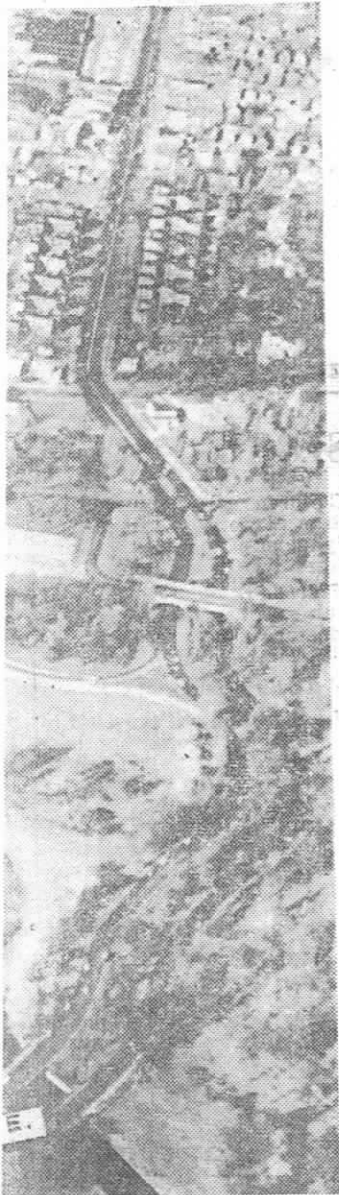
lake at "X" mark was found Saturday afternoon....